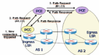
PCE message protocol exchanges

As an alternative to OIF E-NNI routing solutions, especially when TE information confidentiality is required between domains (e.g. for inter carrier routing), or due to CPU resource limitation in the NEs, The IETF has developed the PCE solution.